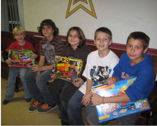
Some of the kids at the Christmas Party.

We had a great time at the Belleview Lodge Christmas Party! Everyone enjoyed the Christmas exchange of presents and many presents went through the maximum number of "exchanges". If you missed this one, plan to come next year; it is a lot of fun!